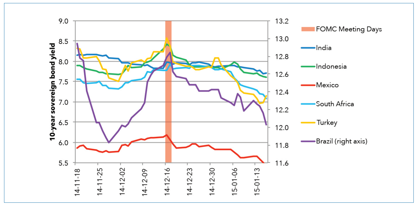
Figure 2: Bond Yields in Select EMEs (two months surrounding the Fed announcement on December 17, 2014)