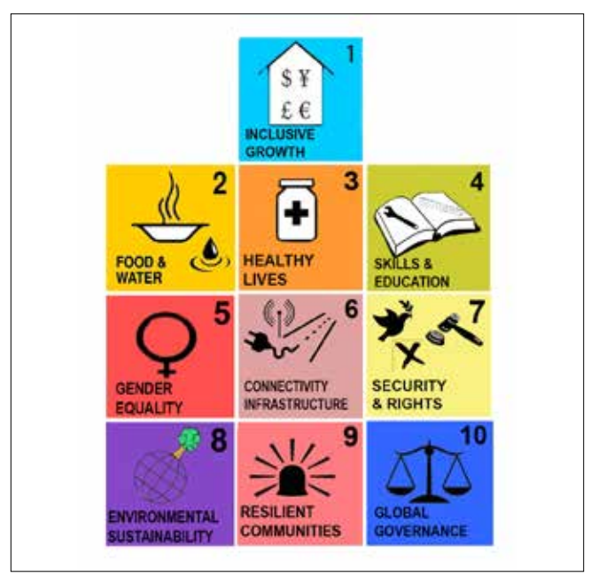
Source: www.cigionline.org/sites/default/files/Post-2015%20 Goals,%20Targets%20and%20Indicators%20background%20 paper_WEB.pdf.

Noting the over constrained nature of selecting post-2015 goals, CIGI and the Korea Development Institute (KDI) led a consortium<sup>4</sup> to address the issues. This global process concluded with a conference in February 2013 in Bellagio, Italy that resulted in 10 goals. For example, the delegation presumed that, unlike the MDGs, a separate goal was required for food security and water (CIGI-KDI goal 2). Given the need to limit the number of goals to 10 at most, room was made for other goals by consolidating the three MDG health goals into one (MDG goals 4, 5 and 6 into CIGI-KDI goal 3). This allowed new goals for connectivity infrastructure (CIGI-KDI goal 6) (with targets for energy, information and communication technologies [ICT] and transportation) and for personal security and human rights (CIGI-KDI