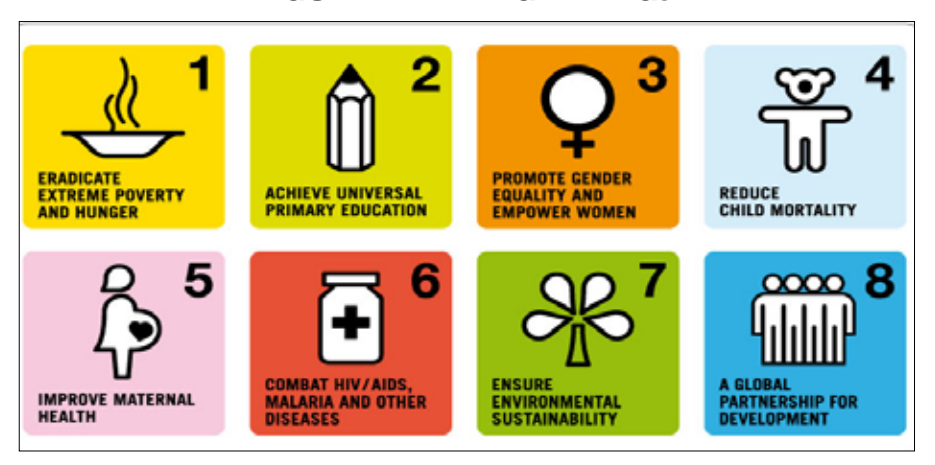
FIGURE 1: THE EIGHT MDGs