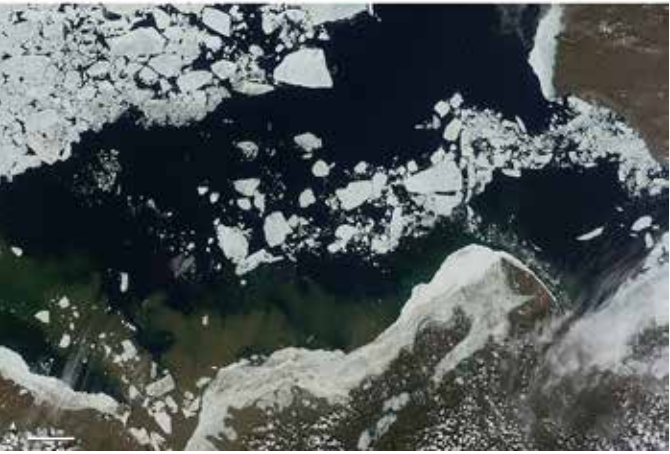
Sea ice retreat in the Beaufort Sea. Top image acquired May 13, 2012; bottom image acquired June 16, 2012.

between the two countries' coast guards and between military authorities through the North American Aerospace Defense Command (NORAD).