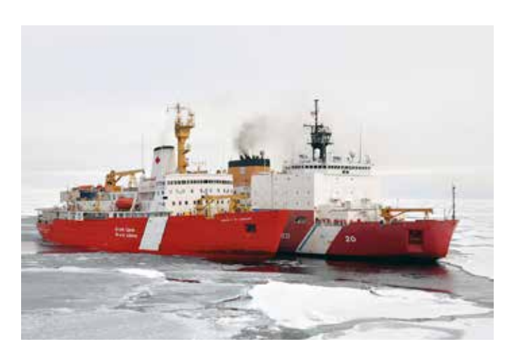
Canadian Coast Guard ship Louis S. St-Laurent ties up to the US Coast Guard cutter Healy in the Arctic Ocean, September 5, 2009. The two ships are taking part in a multi-year, multi-agency Arctic survey that will help define the Arctic continental shelf.

The private sector remains deeply uneasy about lengthy delays in project approvals, multiple, complex and overlapping layers of governance, and the lack of American and Canadian federal government planning and action on strategic marine transport, resource development and infrastructure issues.