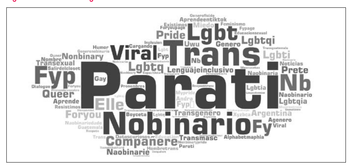
Figure 1: #nobinario Tag Cloud