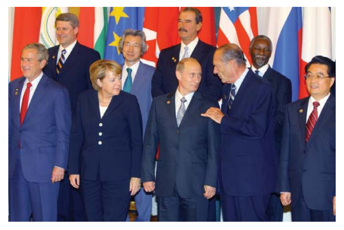
The official photo session of the G8 leaders, invited leaders and heads of international organizations during the 2006 G8 summit.

Other countries took a divergent track. As mentioned, the US did things its own way at Sea Island, moving from an approach that downplayed outreach altogether to one that placed the emphasis on the Middle East. The response rate, however, proved low for this invitation: Afghanistan, Bahrain, Iraq, Jordan, Tunisia, Turkey and Yemen said yes. But Saudi Arabia, Kuwait, Pakistan, Egypt and Morocco said no. So the Bush administration scrambled at the last moment to bring together a blend of African states to Sea Island.<sup>11</sup>