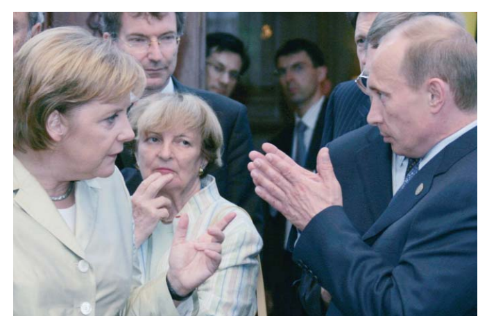
German Chancellor Angela Merkel and Russian President Vladimir Putin following a meeting during the 2006 G8 summit.

Domestically, the coalition nature of the German government has been an important source of this change in approach. The Social Democratic Party Finance Minister Peer Steinbrück has been a vocal champion of G8 reform, with the summit being extended to include select members from the North and South. After making his views known at the November 2006 G20 meeting in Melbourne Australia, Steinbrück repeated them to a home (and increasingly attentive) audience at the Essen meeting of Finance ministers.<sup>17</sup>