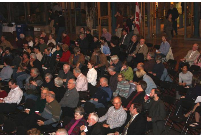
Town Hall participants in Waterloo

On the security front, it is now widely accepted that there is no military solution to the Afghan conflict. The cornerstone of NATO's strategy should be an integrated approach that prioritizes support for development and governance promotion activities over combat operations. Clearing areas of insurgents has not been the problem of NATO and the Afghan government; holding and building areas liberated from the Taliban have. NATO forces must work to develop closer synergies with development agencies and NGOs to achieve greater joint effect in insecure areas.