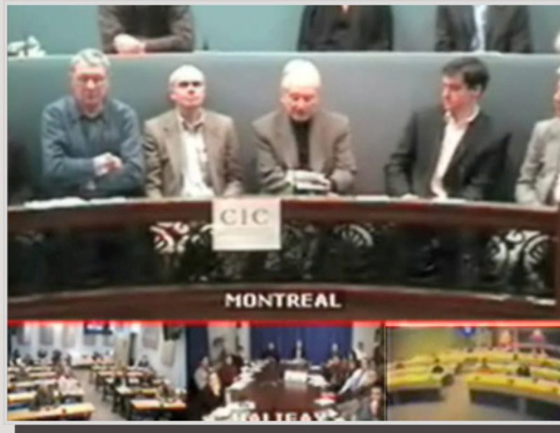
Image at right gives a screenshot of the video broadcast

Video conferencing made the Town Hall a truly national event, enabling interactive dialogue between the panel of experts and participants at six CIC branch locations across the country.