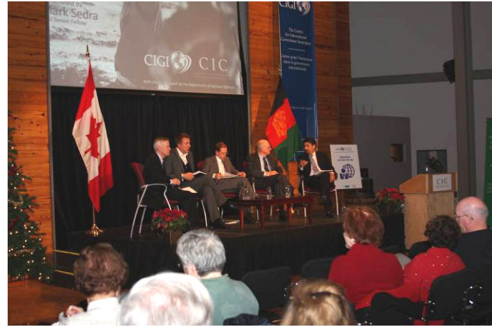
The panel of experts makes their concluding remarks

Some isolated efforts such as the Peace Through Strength (PTS) program have been implemented in recent years to draw moderate Taliban away from the movement in exchange for small-scale incentives; however, such initiatives have had mixed results and were aimed at splitting the Taliban movement rather than finding a peace settlement. Developments in 2008 and early 2009 show that more serious efforts may be underway to find common ground. For instance, in October 2008, the Saudi King sponsored informal talks between the Karzai government and former Taliban leaders in Saudi Arabia. As several Town Hall participants remarked, peace talks with the Taliban will be difficult as it is not a homogenous group and many of its leaders see no reason for compromise while in a position of perceived strength. While the Afghan government has not publicly outlined its “red lines” for any prospective negotiation with the Taliban, the integrity of the constitution and its protections for individual rights, including those of women, would surely be a big one. Nonetheless, it is a positive sign that a process to forge a more inclusive political settlement may be possible and has the support of international donors.