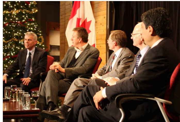
The panel of experts assembled in CIGI's atrium

On December 9, 2008, the Canadian International Council (CIC), in cooperation with The Centre for International Governance Innovation (CIGI), convened a Town Hall on The Way Forward in Afghanistan , in Waterloo, Canada. Convened shortly after national elections in Canada and the United States, the Town Hall was framed as a mechanism to collect input and advice for new governments in both countries. The purpose of this discussion was threefold: to provide Canadians with a comprehensive view of the current situation in Afghanistan, to offer a forum for a wide variety of interested individuals to express their views and opinions, and to spur a genuinely inclusive national debate.