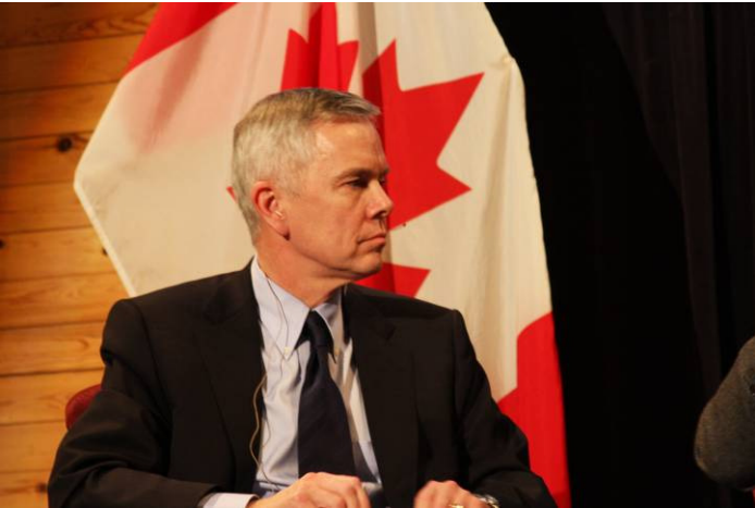
Deputy Minister David Mulroney

Just as worrying for policy makers and military strategists as the growing intensity of violence in the south and east of the country, the centre of gravity for the insurgency, has been the gradual expansion of insurgent activity into previously stable areas, like the central provinces of Wardak and Loghar. Mr. Mulroney noted that the Taliban has “largely been displaced rather than defeated,” in effect creating numerous and shifting frontlines. The Taliban lack the capacity to unseat the central government in Kabul, but that is not their short or medium-term strategy. Rather, they seek to prevent the state from fully establishing its presence across the country and delivering public goods, thereby de-legitimizing it in the eyes of the population.