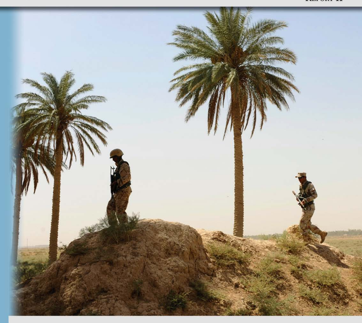
Ensuring Security and Setting the National Security Agenda