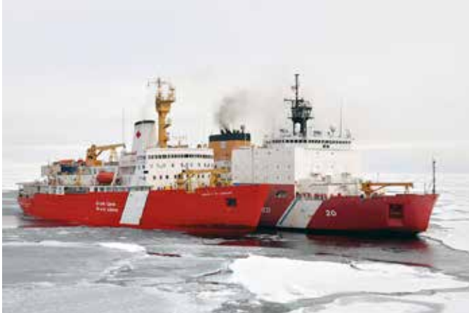
Canadian Coast Guard ship Louis S. St-Laurent ties up to the US Coast Guard cutter Healy in the Arctic Ocean, September 5, 2009. The two ships are taking part in a multi-year, multi-agency Arctic survey that will help define the Arctic continental shelf.

The private sector remains deeply uneasy about lengthy delays in project approvals, multiple, complex and overlapping layers of governance, and the lack of American and Canadian federal government planning and action on strategic marine transport, resource development and infrastructure issues.