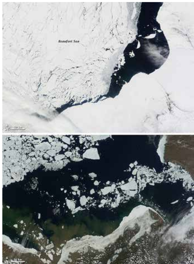
Sea ice retreat in the Beaufort Sea. Top image acquired May 13, 2012; bottom image acquired June 16, 2012.

Despite the slow progress, work is still being done. The Canadian federal government has a number of current programs that support resource project development and mapping, bathymetric work, ice monitoring, off-shore petrochemical leasing, and environmental and scientific research. Further, the Canadian and American governments are pursuing international discussions on search and rescue, oil spill remediation and polar shipping standards. Good binational cooperation exists