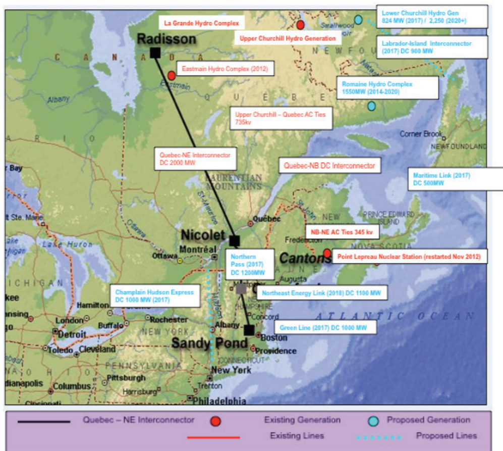
FIGURE 1: SNAPSHOT OF CERTAIN EXISTING AND PROPOSED GENERATION AND TRANSMISSION PROJECTS IN EASTERN CANADA AND THE NORTHEAST UNITED STATES