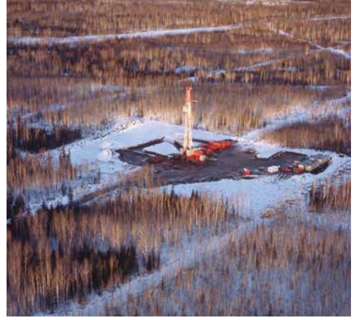
Drilling rig working in a northern Canadian forest.

In sum, in the Canadian context, the benefit-sharing approach appears to be a means to compensate for the lack of participation of Aboriginal peoples in the decisions regarding the extraction of natural resources in their territories, while for industries it is a way to gain a "social licence" and reduce uncertainty. The current right to FPIC of the international legislation and the current right to consultation and accommodation of the Canadian legislation are intended to increase the participation of Aboriginal peoples within the governance of extractive projects.