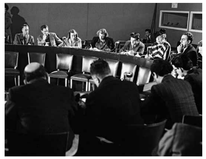
Eleanor Roosevelt, chairman of the Human Rights Commission, and Charles Malik, chairman of the General Assembly's Third Committee (second from right), during a press conference after the completion of the UDHR on December 7, 1948.