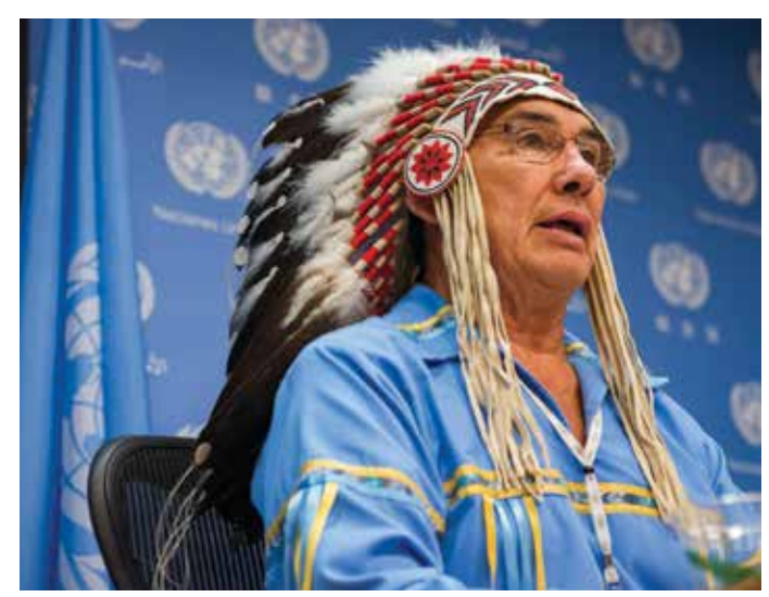
Chief Wilton Littlechild, Advisor to the Secretariat of the UNPFII, addresses the press conference on the World Conference on Indigenous Peoples on September 22, 2014.

social and economic indigenous issues, including health (Department of Economic and Social Affairs 2013). The Federation of Saskatchewan Indian Nations and certainly the Assembly of First Nations and other indigenous groups have been active in UNPFII meetings for some time. Their participation clearly supports UNPFII's intent, even though they may have some reservations on any timely implementation (Assembly of First Nations 2013b).