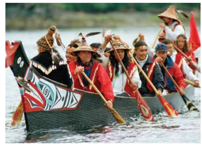
A Squamish Nation canoe approaches Bella Bella.