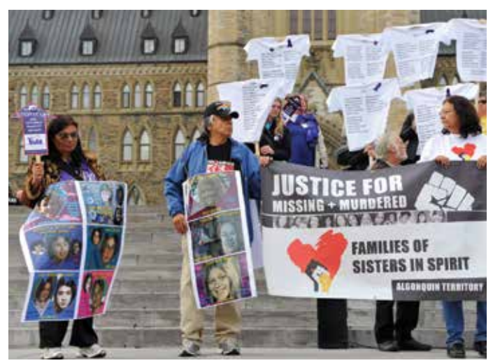
People gather to hold a rally on Parliament Hill in Ottawa on October 25, 2012, demanding that the Canadian government develop a national action plan to end violence against women.

constitutional requirements and the responsibilities as a signatory to UNDRIP.