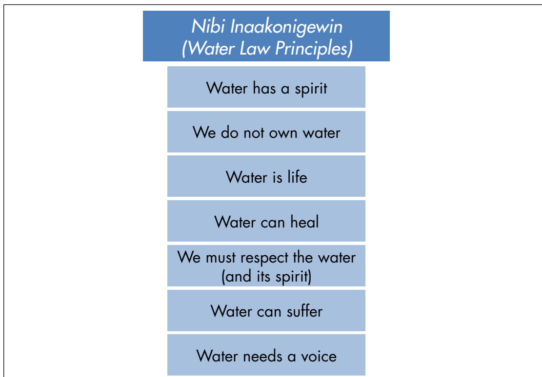
Figure 2: Nibi Inaakonigewin (Water Law Principles)