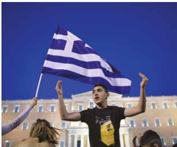
A young man protests austerity measures at the Greek Parliament. CIGI's Global Economy Program is developing ideas for sovereign debt restructuring to address debt crises such as those troubling the euro zone in recent years.

CIGI believes that better international governance can improve the lives of people everywhere, by increasing prosperity, ensuring global sustainability, addressing inequality and safeguarding human rights, and promoting a more secure world.