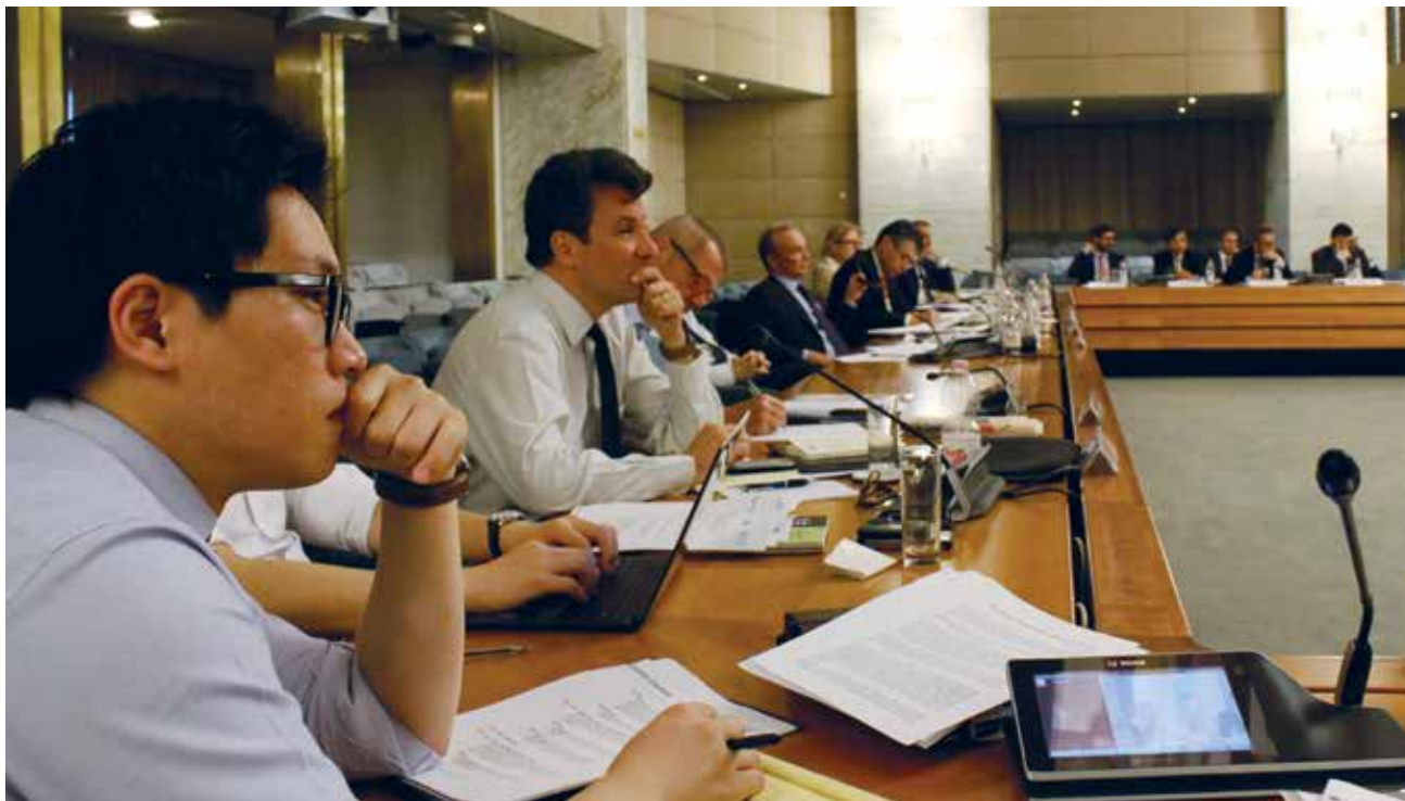
Delegates convene at the D-10 Strategy Forum in June 2015. CIGI, the Atlantic Council and Institute of International Affairs in coordination with the Italian Ministry of Foreign Affairs and International Cooperation hosted the meeting in Rome, Italy, to explore common challenges and interests in economic and security matters.

have their own special role to play in meeting such challenges. CIGI's policy work in this broad field is focused in these initiatives: