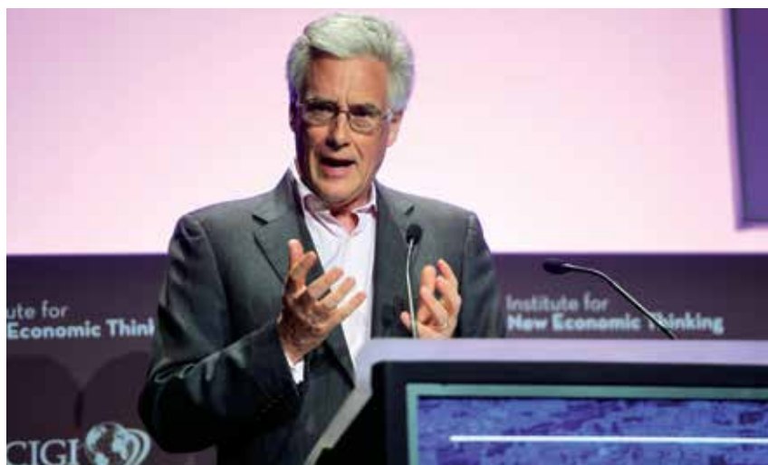
In Paris in April 2015, Lord Adair Turner addresses the sixth annual plenary conference of the Institute for New Economic Thinking, titled "Liberté, Égalité, Fragilité," in which CIGI also participated.

(Co-sponsored by CIGI and the University of Ottawa)