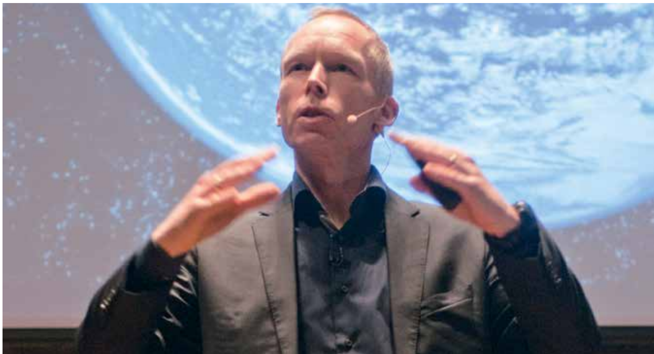
Johan Rockström, executive director of the Stockholm Resilience Centre, delivers a public lecture at CIGI in March 2015 titled "Big World, Small Planet: Abundance Within Planetary Boundaries." Rejecting the idea that humanity can achieve economic growth only at the expense of the environment, Rockström argues that sustainable prosperity is possible.