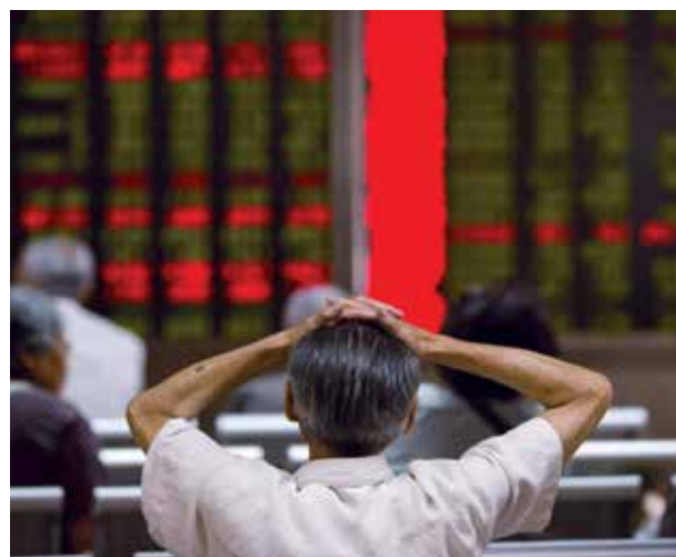
An investor monitors volatile markets at a Beijing brokerage in July 2015. CIGI's researchers are exploring the policy implications of China's increasing importance in the global economy.