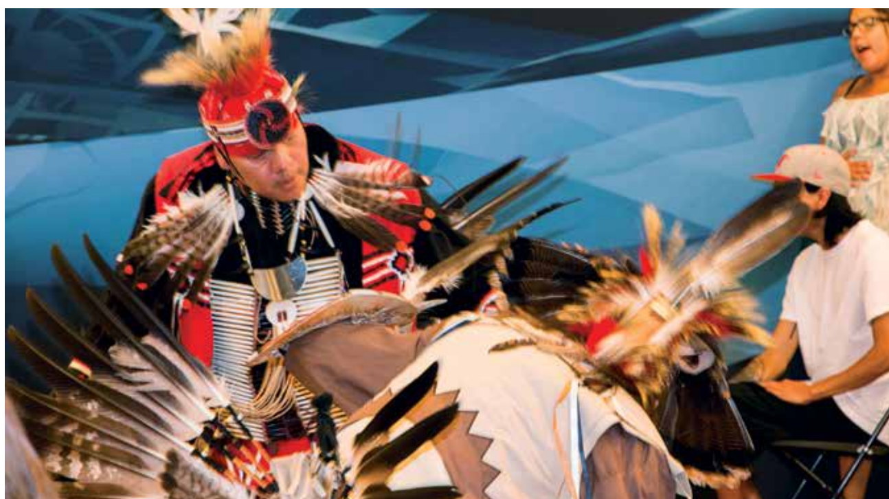
A traditional drum and circle dance was featured during a CIGI International Law Research Program consultation workshop, at the CIGI Campus in June 2015, on the relationship between extractive industries and indigenous peoples.

Washington, DC, United States, Oct. 6, 2014