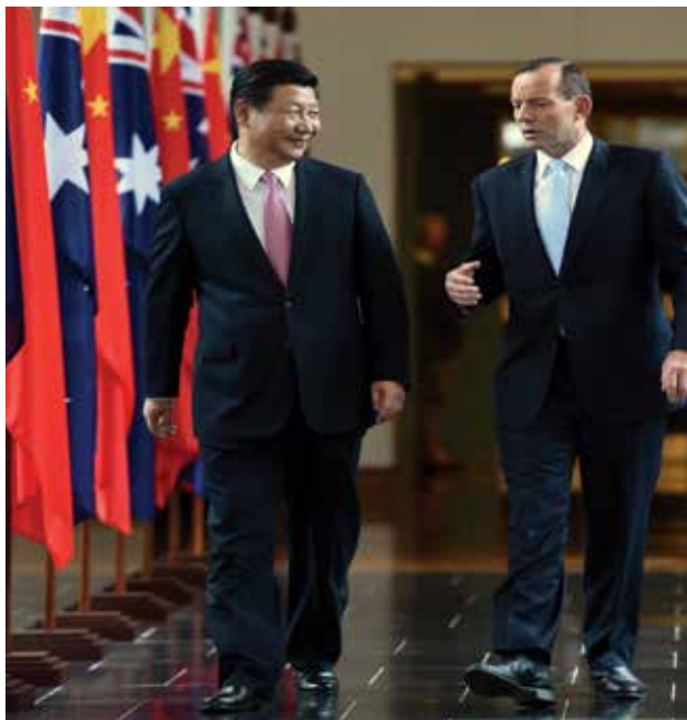
As China's global economic role continues to grow, Chinese President Xi Jinping, left, met Australian Prime Minister Tony Abbott in Canberra, before the November 2014 G20 Leaders' Summit in Brisbane.