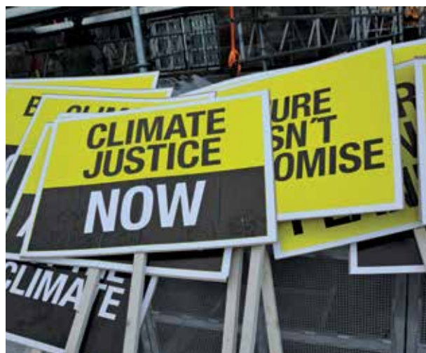
Climate change is a growing concern around the world. CIGI's research programs tackle the issue through a variety of frameworks including financial sustainability, political negotiations and international environmental law.