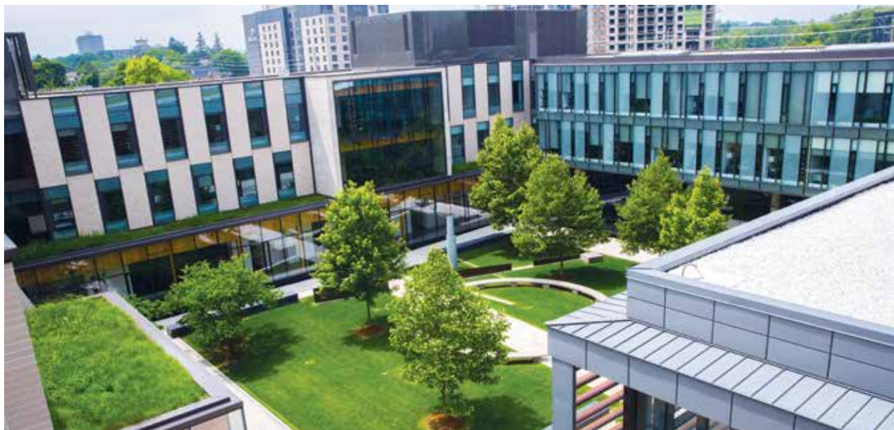
CIGI's new headquarters, as of fall 2014, is in the splendid CIGI Campus building in Waterloo, Canada. Built on land donated by the City of Waterloo with funds from the governments of Canada and Ontario, and matched by CIGI Chair Jim Balsillie, the facility was designed by KPMB Architects and has received multiple design awards.