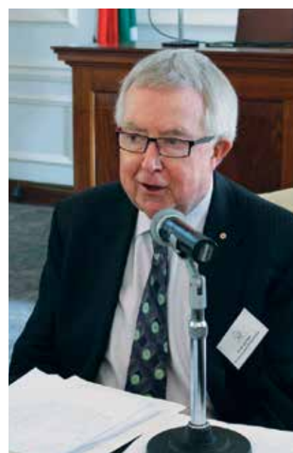
Former Canadian Prime Minister the Rt. Hon. Joe Clark addressed a panel at a CIGI co-hosted event in Pretoria, South Africa, in June 2015 on governance innovation in Africa.

Meeting of the Committee on International Economics and Policy Reform (CIEPR) Cambridge, MA, United States, July 8, 2015