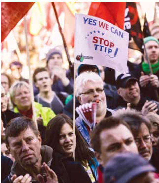
Crowds protest new regional trade agreements, such as the Transatlantic Trade and Investment Partnership and the Comprehensive Economic Trade Agreement, in Berlin, Germany, in 2015.