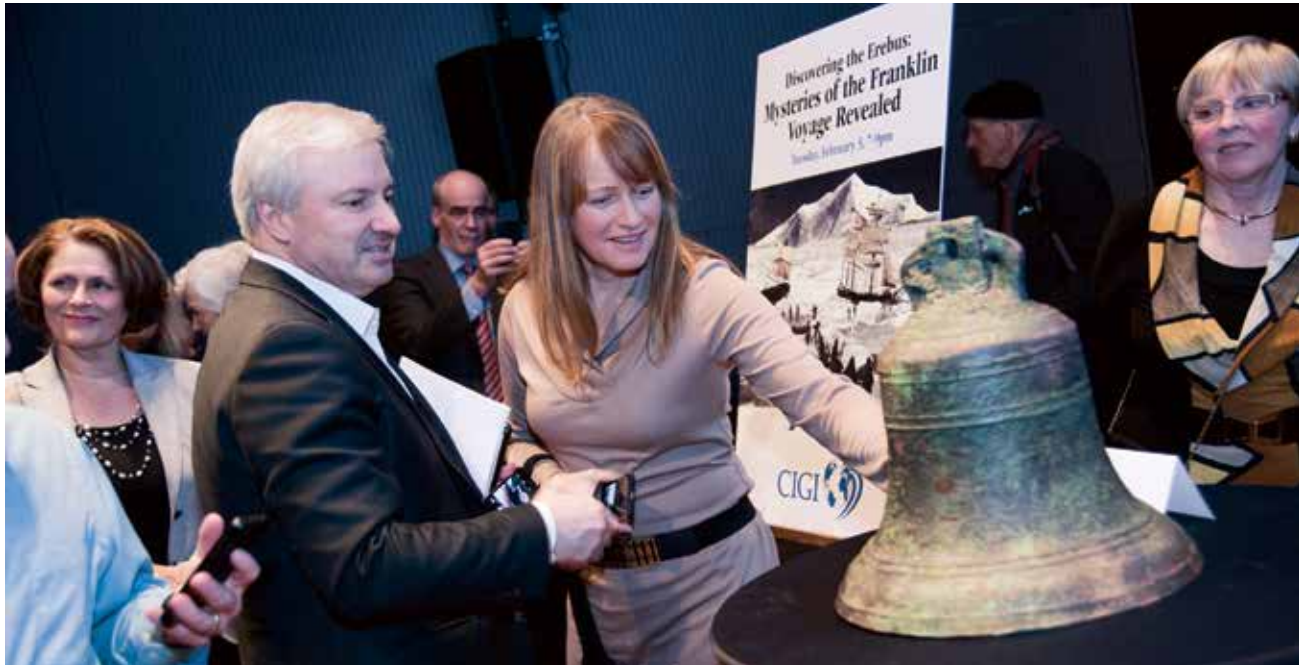
Audience members at a CIGI public event admire a replica of the bell from HMS Erebus , one of two ships lost during the 1845 Franklin expedition to the Arctic. Two Canadian scientists who helped find the wreck of the Erebus in the summer of 2014 spoke at a CIGI lecture in February 2015 about the historic discovery.

CIGI's global outreach initiatives include conferences, workshops, round tables and public lectures to promote dialogue on policy issues and advance ideas for improved global governance. This past year CIGI organized, hosted, sponsored or participated in 192 events in 26 countries from Canada to Greece, and from Shanghai to South Africa, directly engaging with over 7,300 people including policy makers in government and other institutions, business people, academics and other policy experts. Many of the public events were either live-webcast to a global audience, or were videotaped to be posted online or syndicated through media channels for wide viewership.