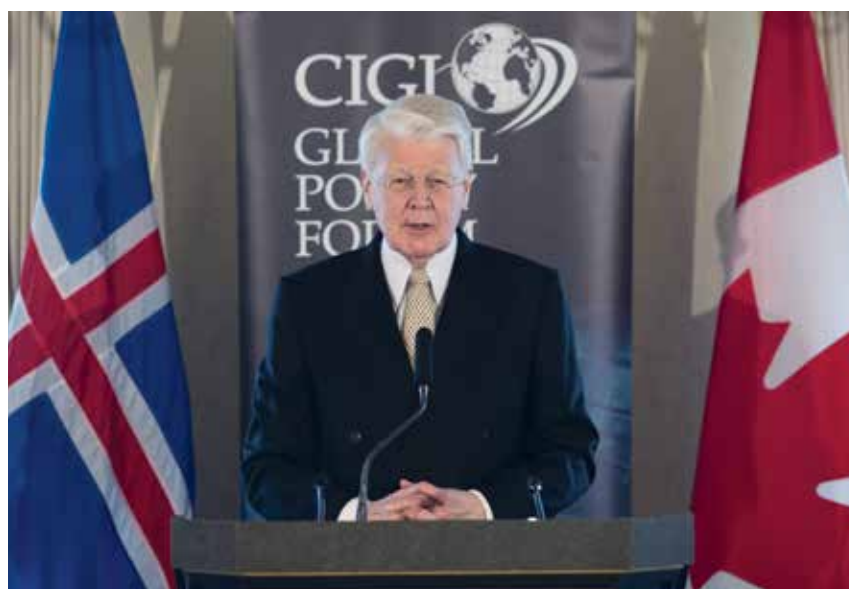
Ólafur Ragnar Grímsson, president of Iceland, addressed a June 2015 breakfast co-hosted by CIGI and the Icelandic Embassy in Ottawa, Canada, on improved models for global cooperation in the Arctic.