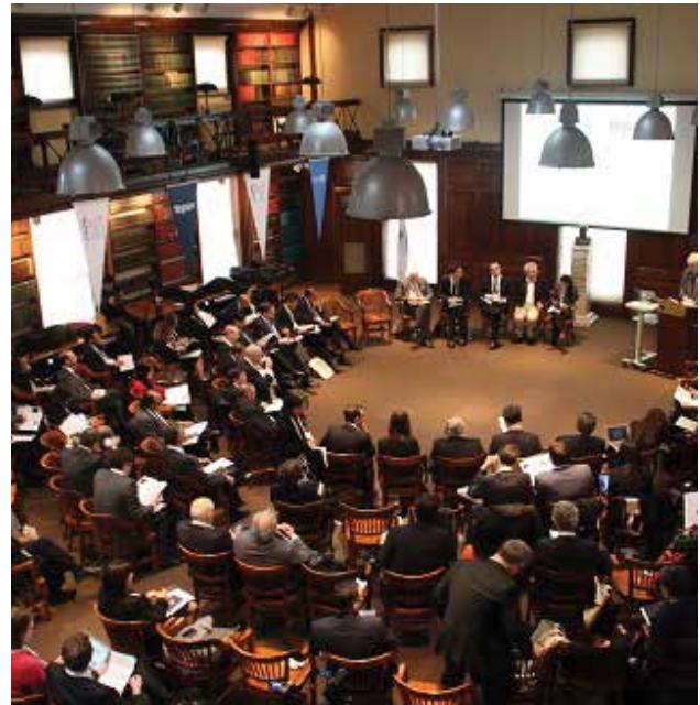
The T20 process for the 2015 G20 presidency of Turkey was launched at a meeting in Istanbul in February 2015 by CIGI and TEPAV.

The Fixing Climate Governance project is designed to generate some fresh ideas. First, a public forum was held in November 2014. High-level workshops then developed a set of policy briefs and short papers written by experts. Several of these publications offer original concrete recommendations for making the UNFCCC more effective.