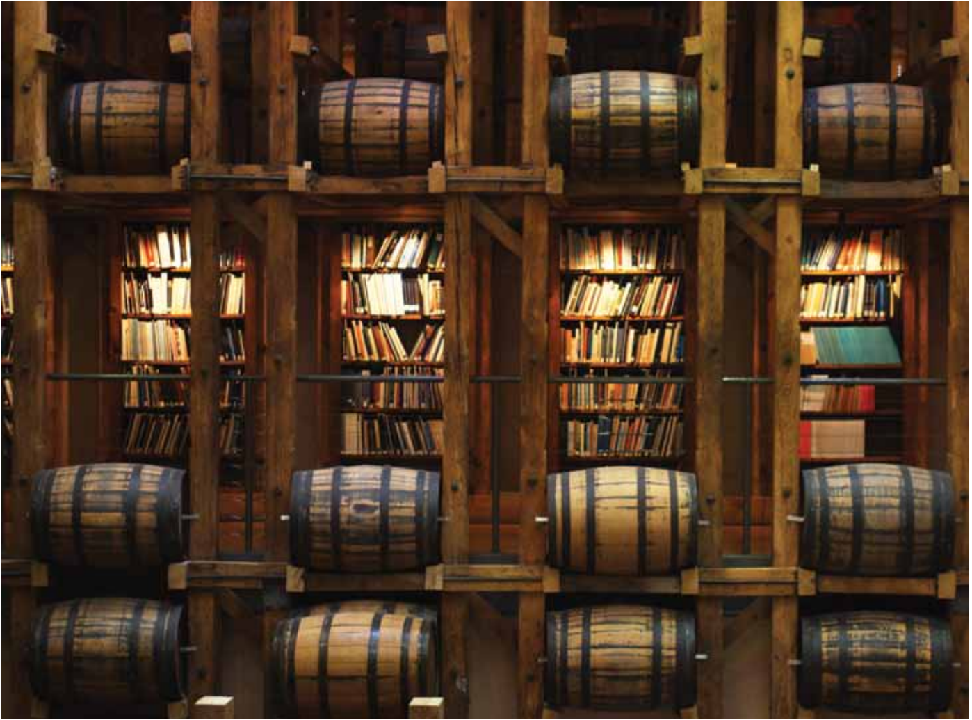
The year 2009-10 marked growth in CIGI's research activities, as well as an internal review at its headquarters in the former Seagram distillery warehouse.