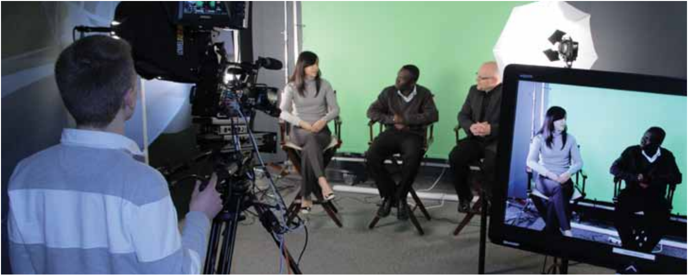
Completion of the broadcast studio in 2010 enables CIGI experts to take part in live interviews with networks around the world.