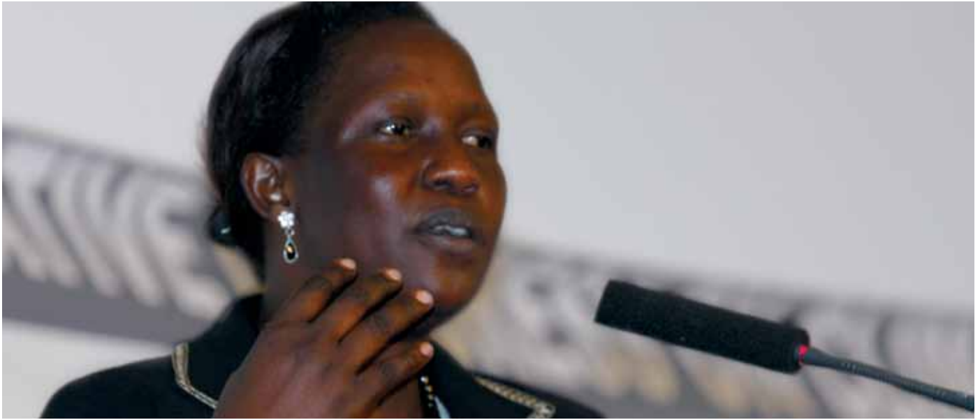
Hon. Maria Mutagamba, Uganda's Minister of Water and Environment, was among the keynote speakers at Africa's Climate Change Reality: The Africa Initiative Congress on Climate Change, which CIGI hosted in Kampala in November 2009. The Africa Initiative is CIGI's joint undertaking with Uganda's Makerere University.