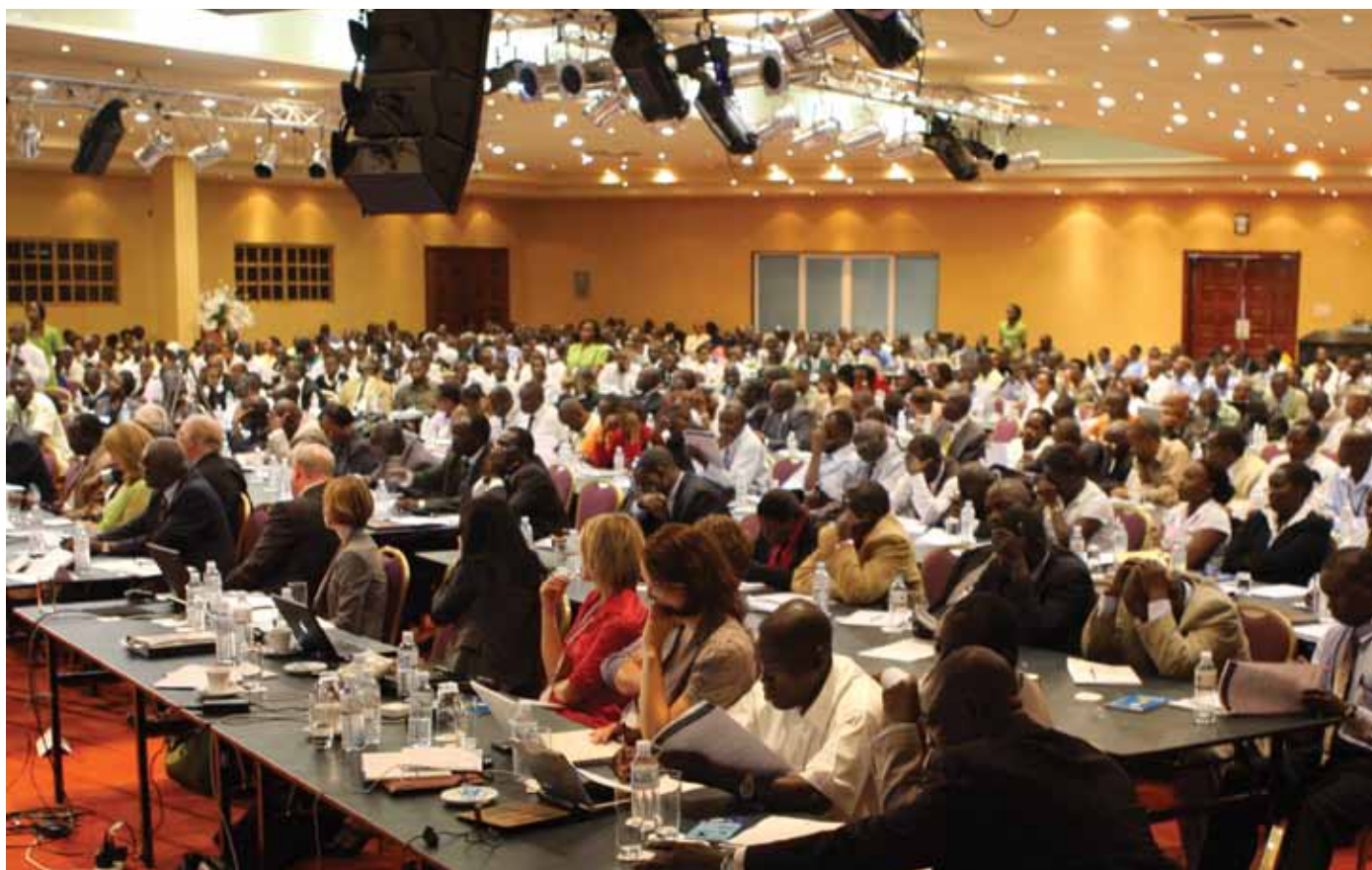
More than 700 delegates, including community leaders, policy makers, researchers and students, attended Africa's Climate Change Reality: The Africa Initiative Congress on Climate Change, in Kampala in November 2009. The event was a partnership between CIGI, Makerere University and the Salama SHIELD Foundation.

CIGI continued to collaborate with Makerere University in Uganda on the Africa Initiative. The Nuclear Energy Futures project, a multi-year project conducted in partnership with the Canadian Centre for Treaty Compliance at Carleton University, came to its conclusion.