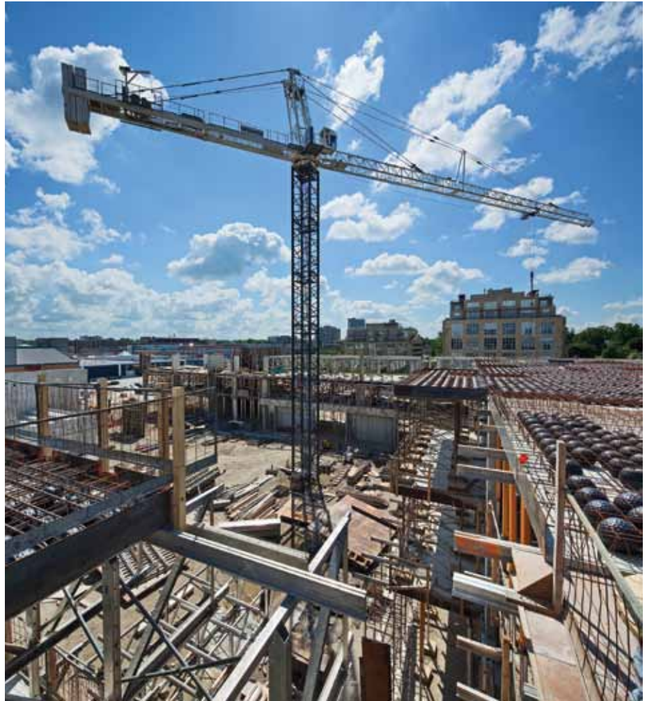
The CIGI Campus started to take shape in 2009-10, as construction of the 114,000-square-foot academic and research complex began.

The campus received federal and provincial funding totalling $50 million through the Knowledge Infrastructure