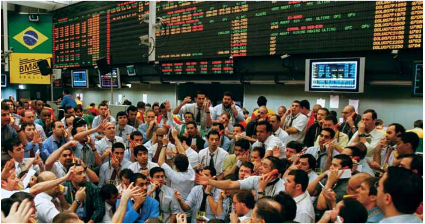
In the CIGI-edited book Emerging Powers in Global Governance , leading international relations experts examined the role of key countries such as Brazil in the potential transformation of the G8.