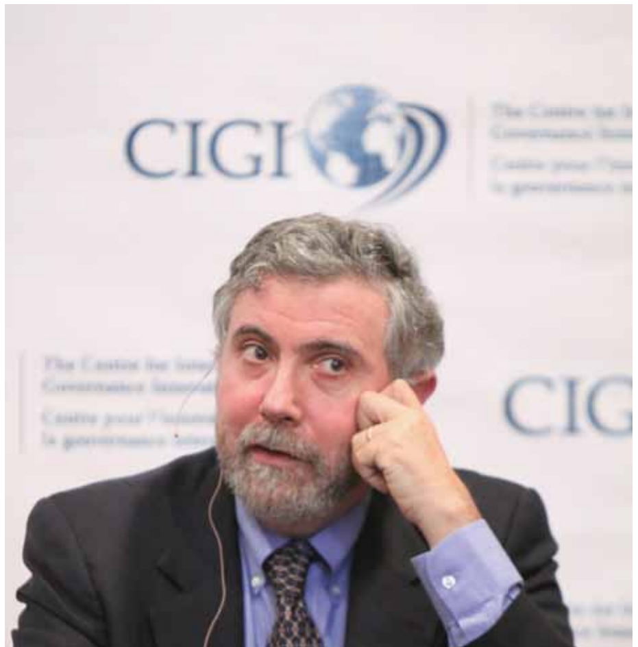
Paul Krugman, winner of the 2008 Nobel Prize in Economics and a professor at Princeton University's Woodrow Wilson School of Public and International Affairs was a keynote speaker at CIGI's fall conference, CIGI '09: Towards a New Global Deal.

The entire conference was well attended by national print and broadcast media, and in return, CIGI received exceptional media coverage.